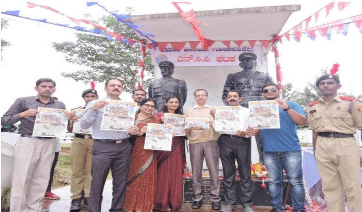
PRESS RELEASE OF "KARGIL VIJAY DIWAS" SPECIAL NEWSPAPER 27/07/2019.