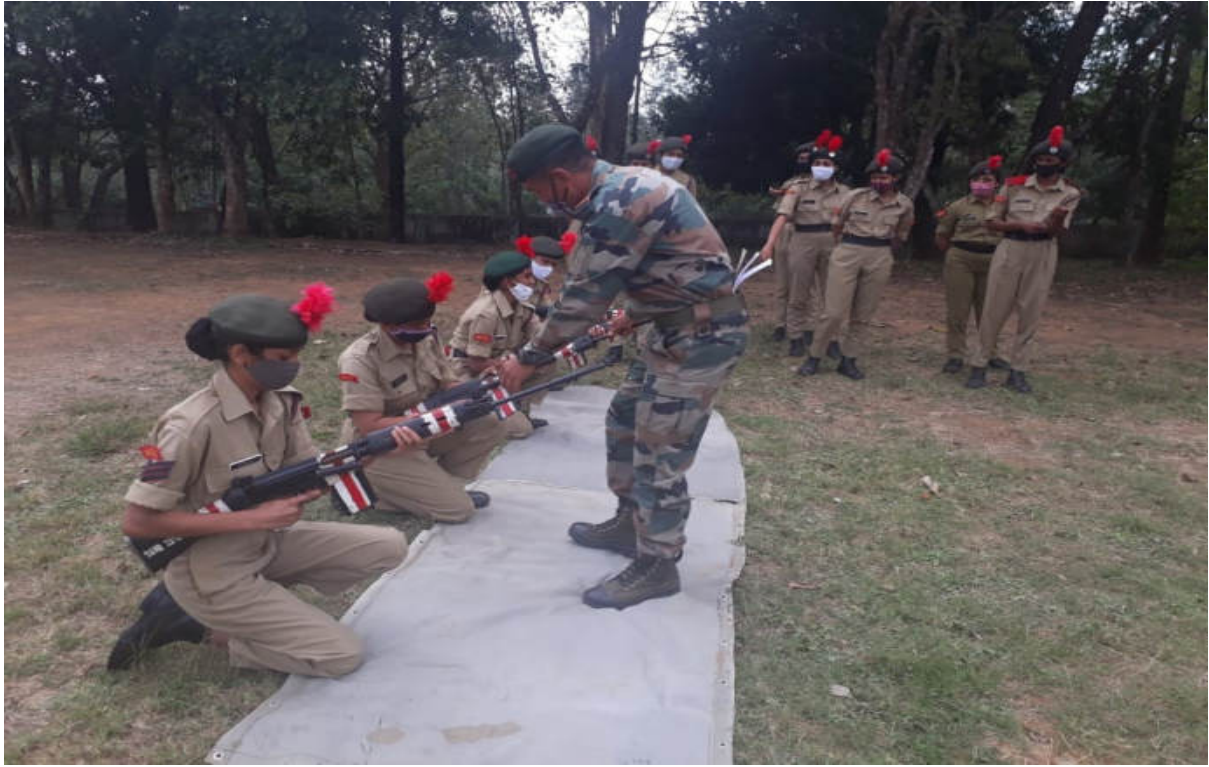
WEAPON TRAINING FOR NCC CADETS AT CAUVERY COLLEGE GONIKOPPAL FOR B AND C CERTIFICATE EXAMS.