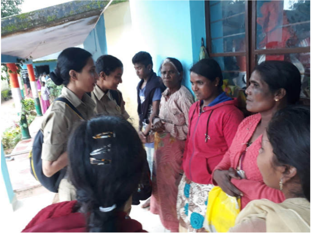
12/08/2019 VISITED FLOOD RELIEF CAMP AT PONNAMPET