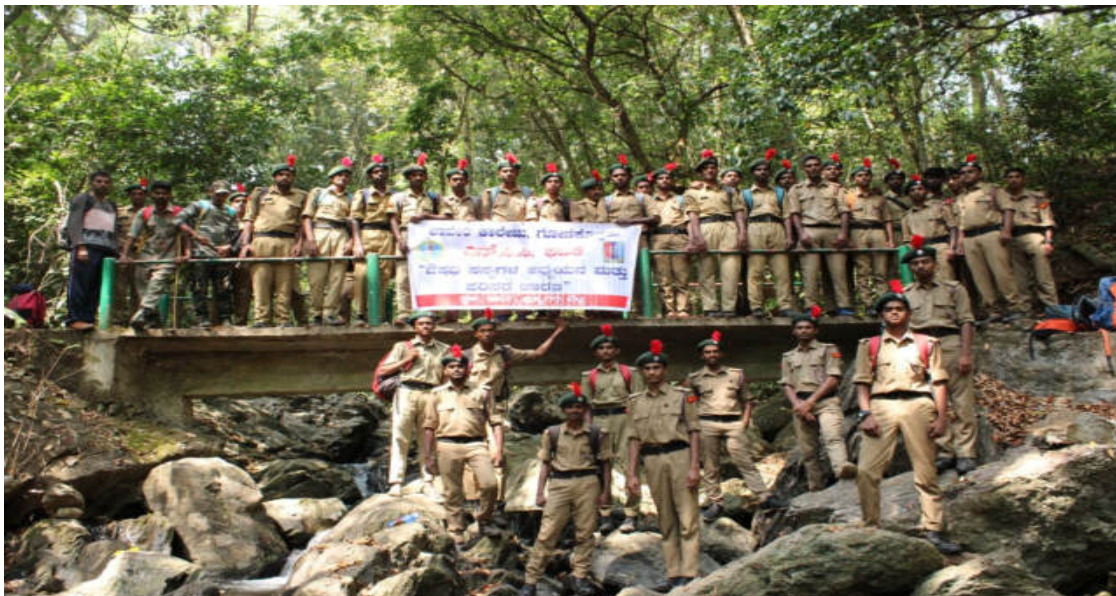
Trekking by NCC cadet at Bhrammagiri Hills on 25-01-2021