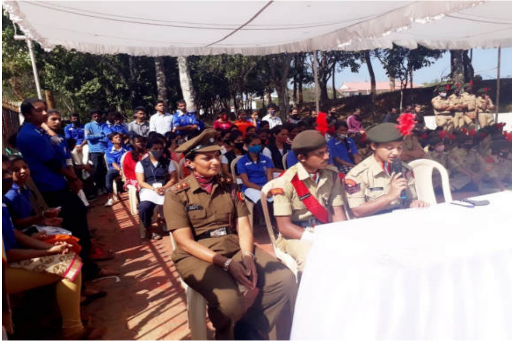
28/01/2022 122 BIRTH ANNIVERSARY CELEBRATION OF FIELD MARSHAL KM.CARIAPPA IN CCG