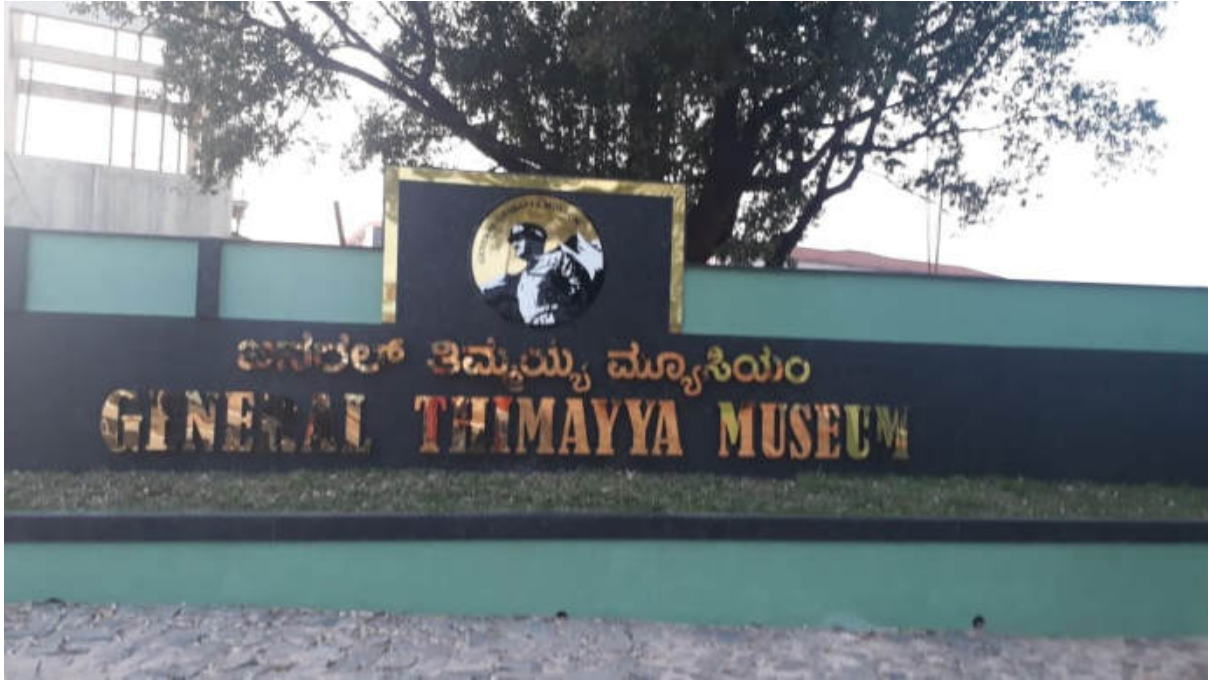
NCC SW CADETS VISITED GENERAL THIMMAIAH MUSEUM AT MADIKERI ON 26/2/2021