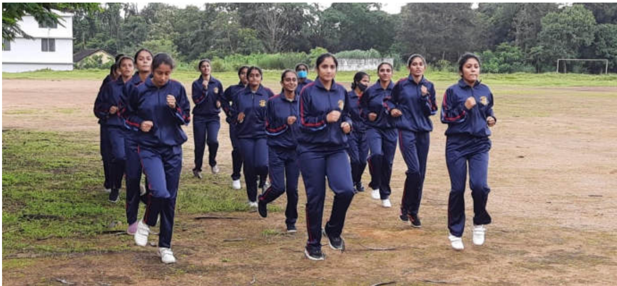
FREEDOM RUN PARTICIPATED DURING INDEPENDENCE DAY 2021