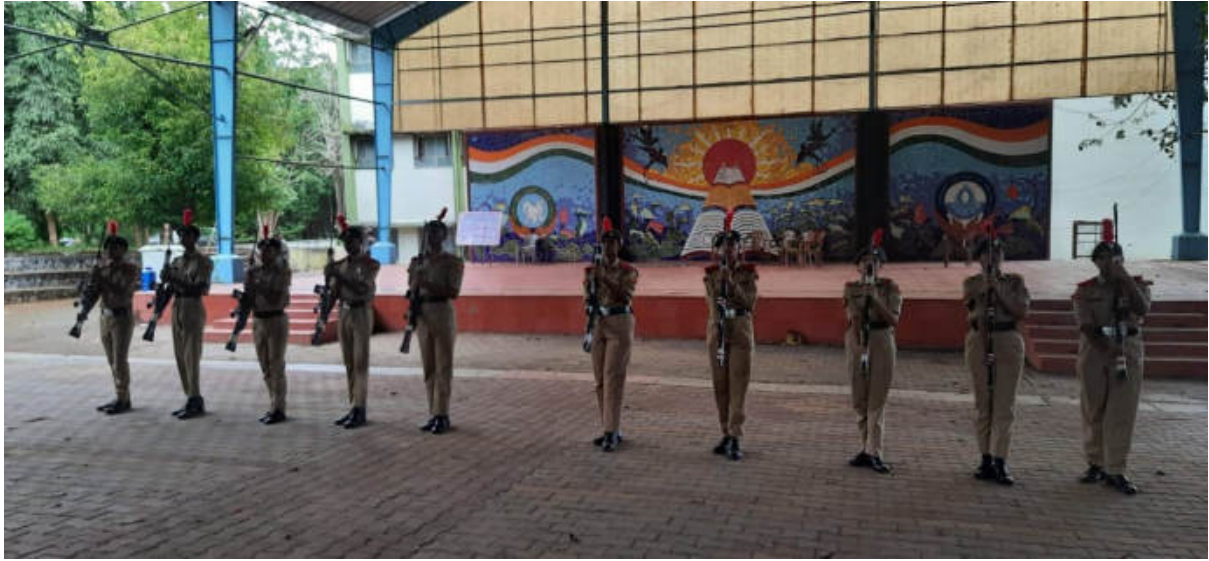
WEAPON DRILL IN CATC CAMP 10SW CADETS WERE PARTICIPATED ON 29/11/21 AT SHIVAMOGGA.