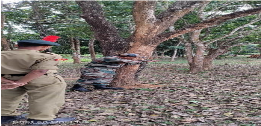
Firing training conducted on 22-09-2021