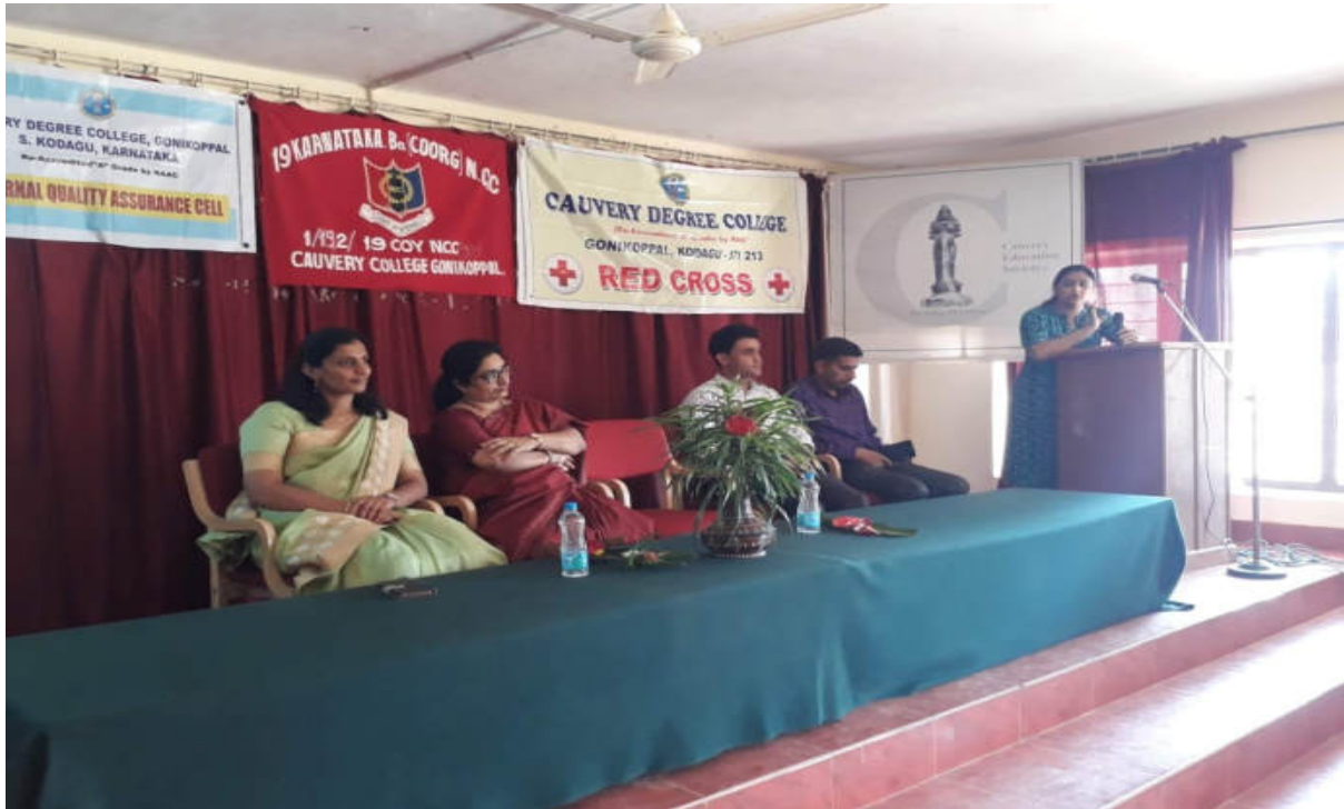
CONDUCTED COVID 19 AWARENESS PROGRAMME AND WORLD WATER DAY ON 13/3/2020 AT CCG