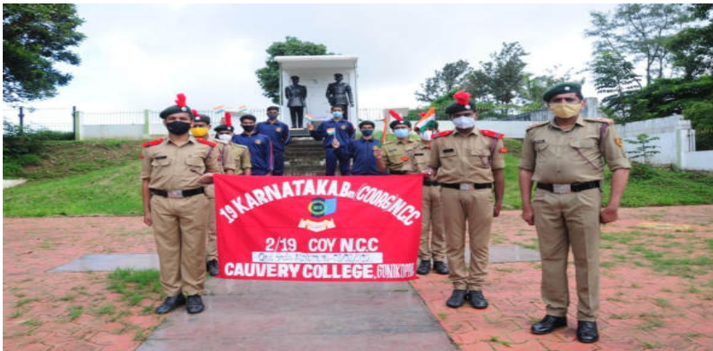
Quit India Movement memorial day celebration on 10-08-2021