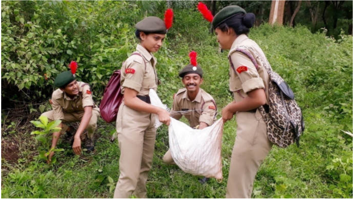
27/07/2019 TREE PLANTATION DRIVE IN THITHIMATHI FOREST