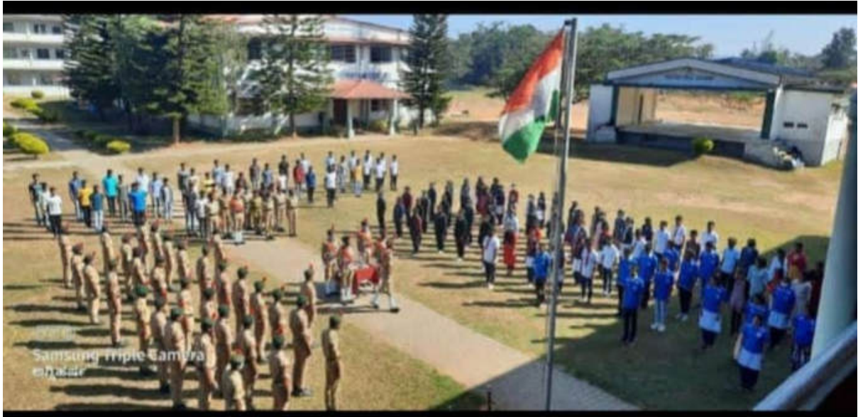
5TH INDEPENDENCE DAY CELEBRATED AT CCG VISITED GOVT HOSPITAL GONIKOPPAL AND DISTRIBUTED FRUITS TO PATIENTS. PARTICIPATED DURING INDEPENDENCE DAY CONDUCTED SPEECH AND SINGING COMPETITIONS FOR CCGNCC CADETS BY ROTARY CLUB GONIKOPPAL.