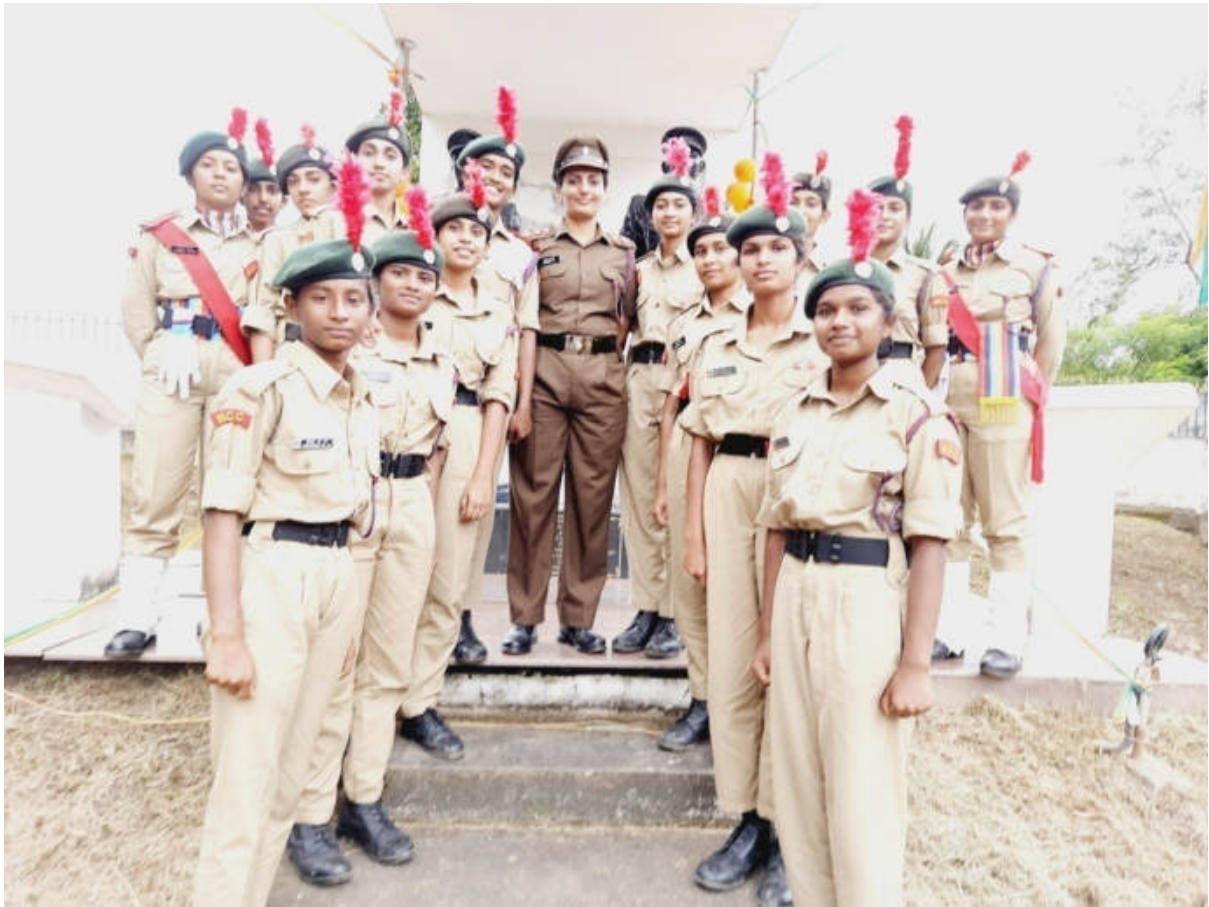
REPUBLIC DAY CELEBRATED ON 26-01-2022