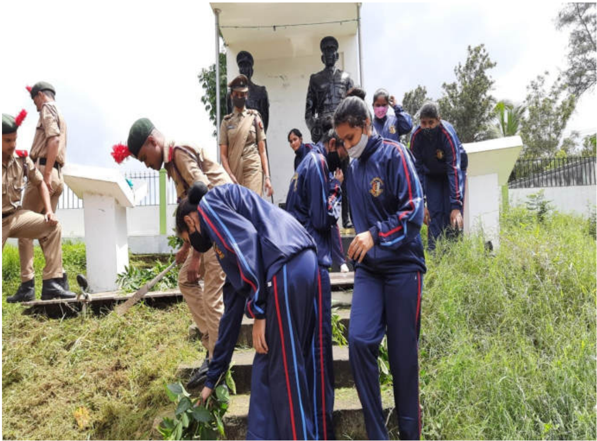
Field Marshal K M Cariappa and Gen.Thimmaiah Staute cleaning by NCC Cadets on 17/7/2021 at CCG 10 SW and 10 SD Cadets and ANO-02 On Behalf Of KARGIL DAY