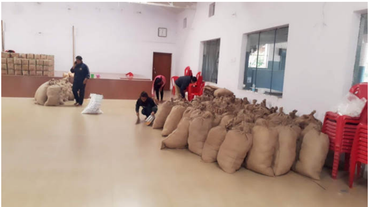
14/08/2019 FOOD PACKING DURING FLOOD RELIEF CAMP AT VIRAJPET