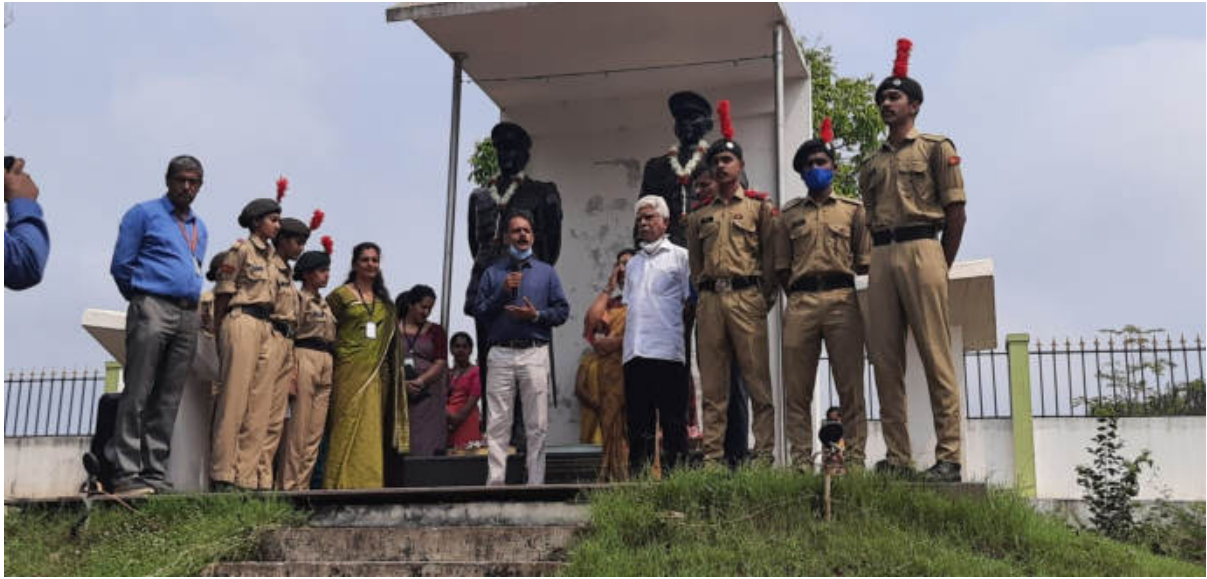
31/03/2022 GENERAL THIMMAIAH BIRTH ANNIVERSARY