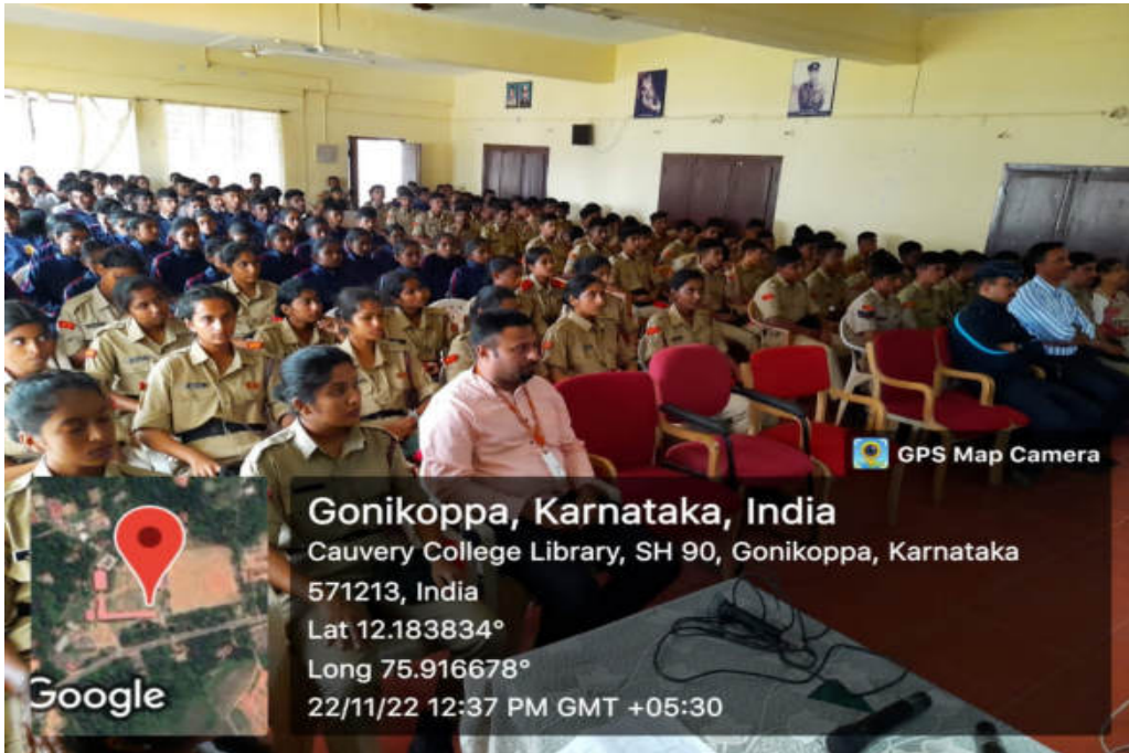
Awareness programme by Indian Air force on 22-11-2022