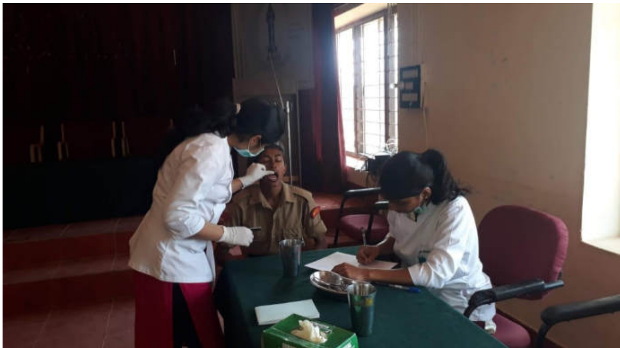
19/02/2022 DENTAL CAMP IN CCG