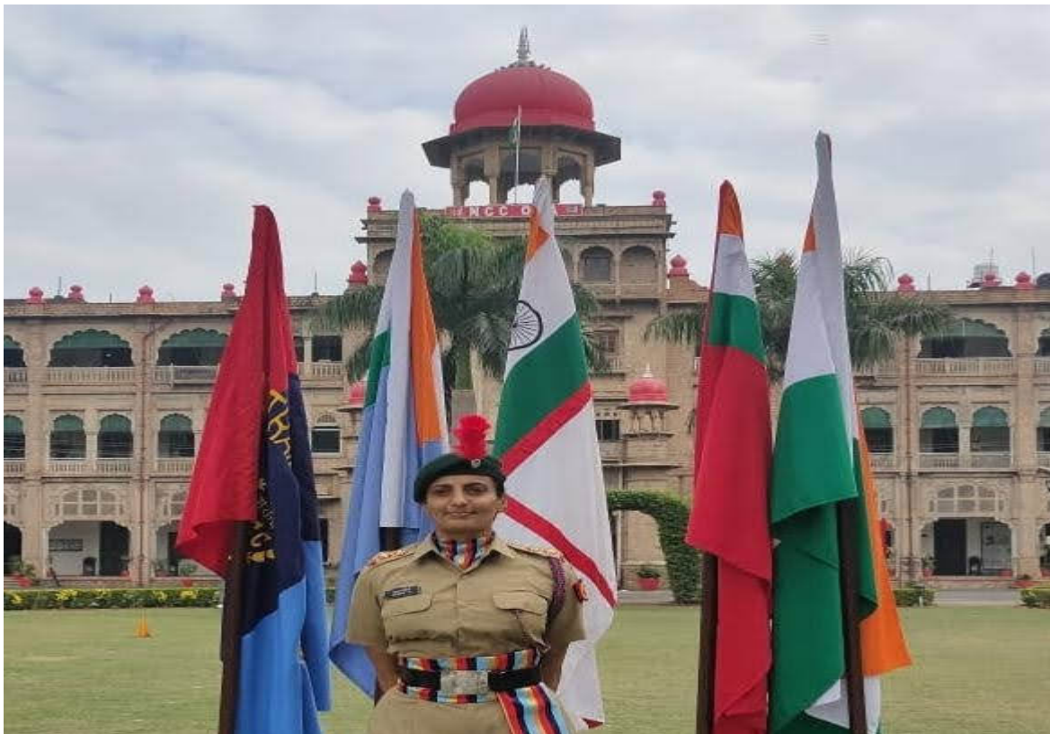
ON 14/12/2020 LT. LEPAKSHI I D AT OTA GWALIOR.AFTER OFFICERS PASSING OUT PARADE.