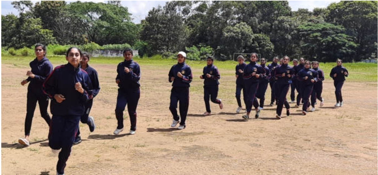
FIT INDIA RUN by NCC Cadets on 15/08/2021. 25 SW Cadets were participated on behalf of INDEPENDANCE DAY.