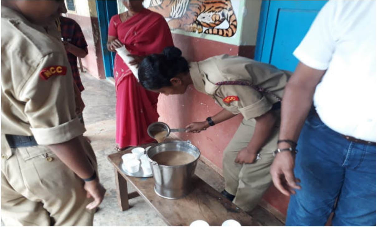
FLOOD RELIEF CAMP 2019