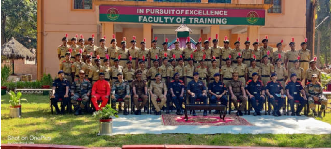
Army attachment camp held at PCTC Bangalore on 09-01-23 to 15-01-2023