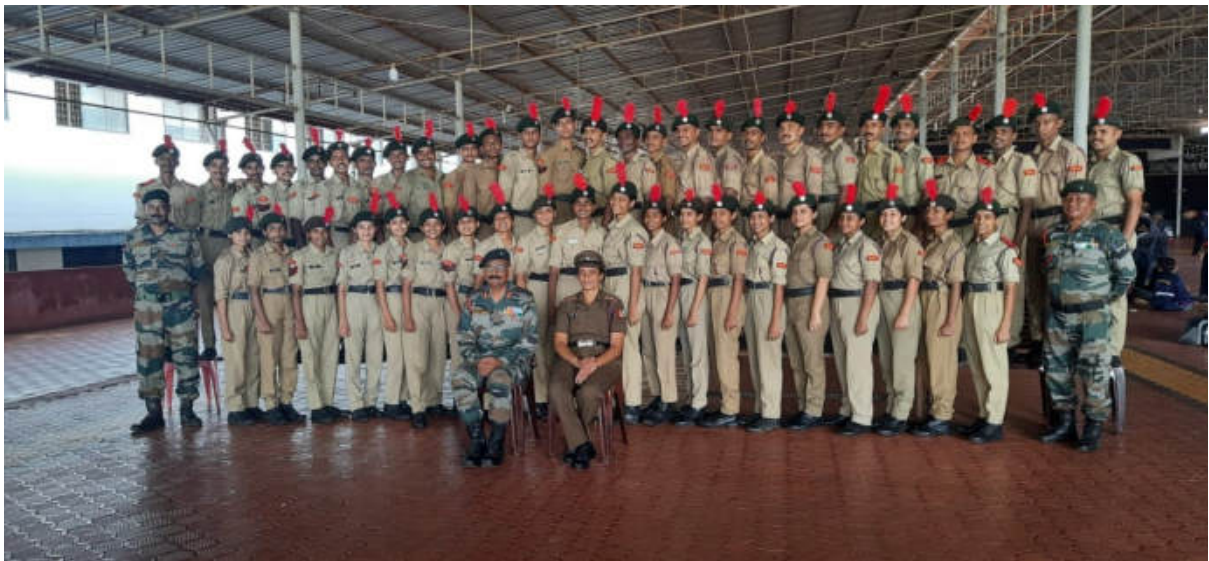
PRE REPUBLIC-DAY CAMP(RDC) AT MOODABIDRI 2021