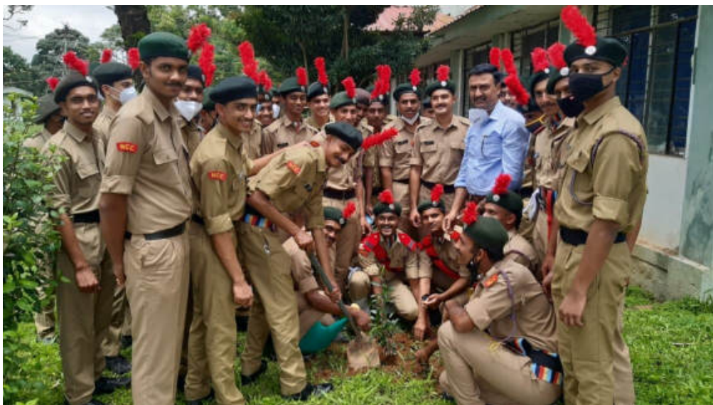
Vanamahotsava celebration on 05-07-2021