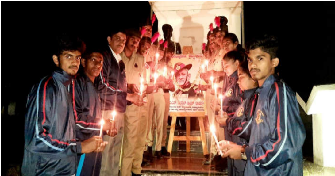
Homage was paid to Late. Gen. Bipin Rawat