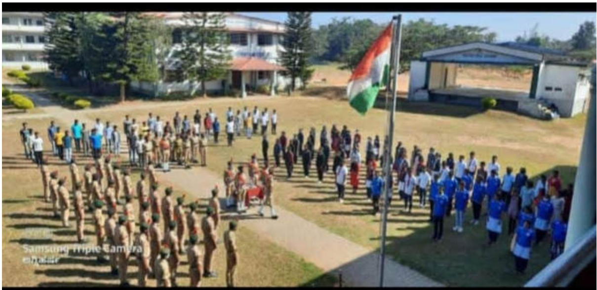
CELEBRATED REPUBLIC DAY ON 26/1/2020 ST CCG. 100 NCC CADETS AND 2 NCC OFFICERS WERE PRESENT. REPUBLIC DAY CELEBRATION 26/1/2021