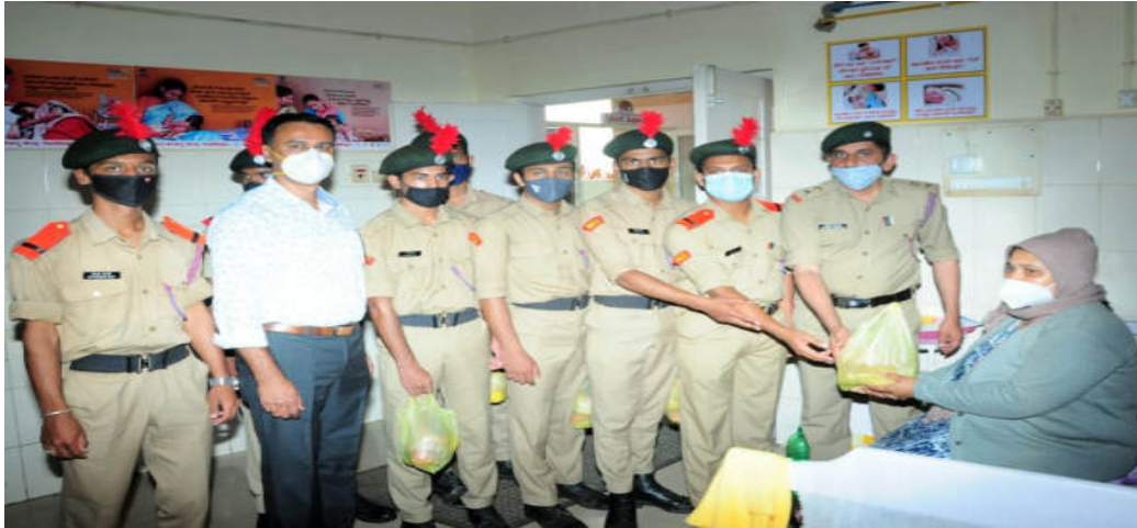
Distribution of fruit and medicine kit at government hospital Gonikoppal on the eve of Gandhi Jayanthi on 02-10-2020