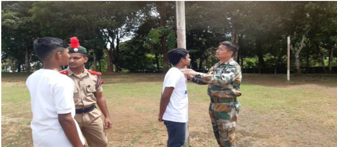
NCC selection camp on 25-07-2021