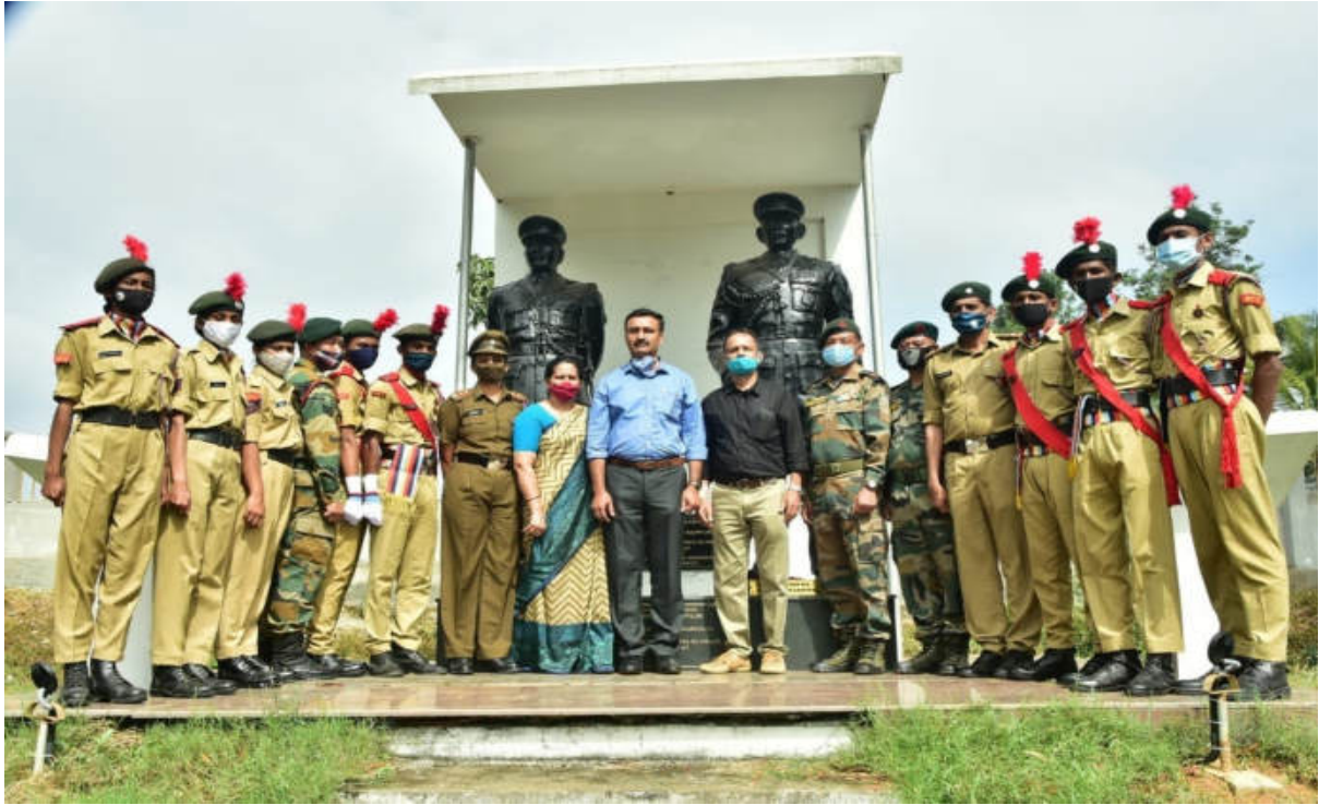
26/01/2021 REPUBLIC DAY