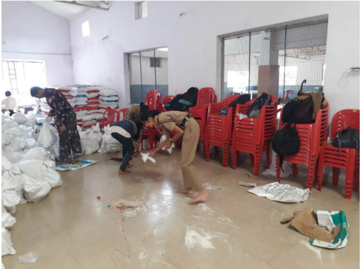
FLOOD RELIEF CAMP, VIRAJPET 2019