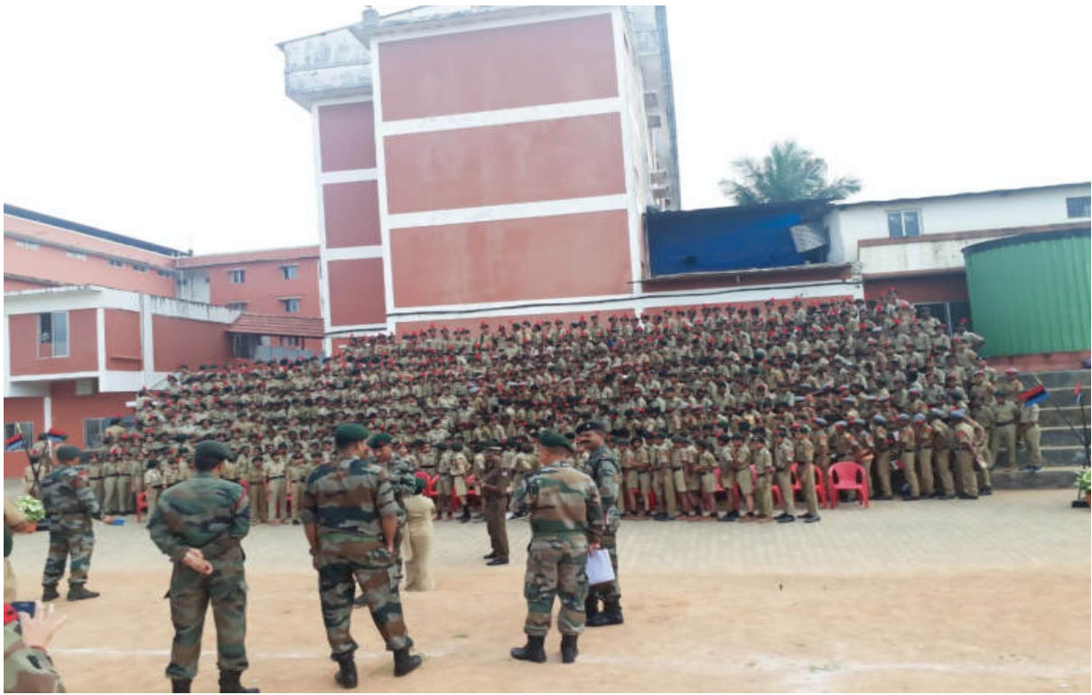
COMBINED ANNUAL TRAINING CAMP AT COPS SCHOOL GONIKOPPAL FROM 27/12/2019 TO 05/12/2020. 15 NCC SW CADETS AND NCC OFFICER LEPAKSHI I D ATTENDED THE CAMP.