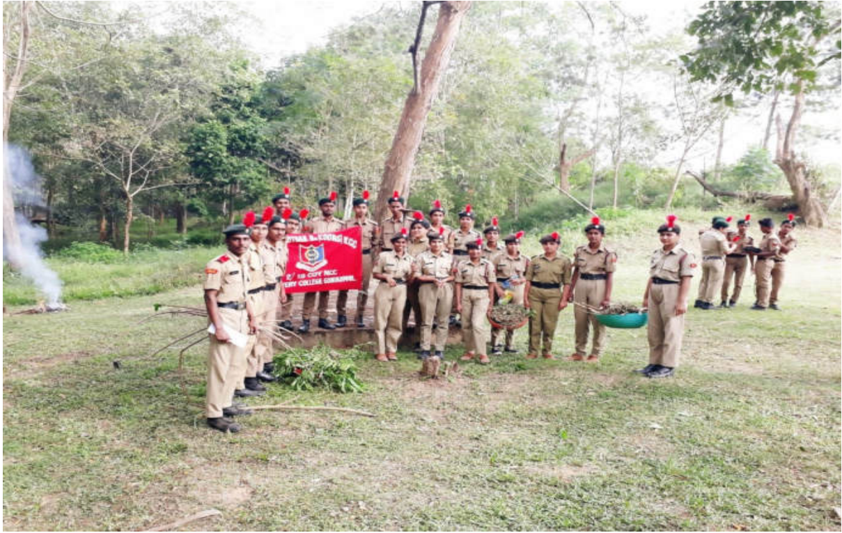
ON 20/11/2019 CONDUCTED SWACHH BHARATH ABHIYAN AT CCG. 40 CADETS CLEANED THE SURROUNDINGS. NCC OFFICERS WERE PRESENT.