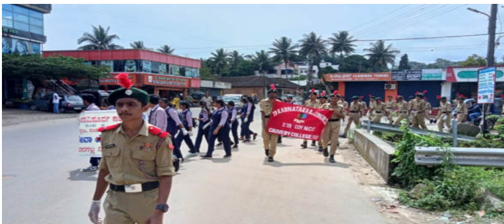
Gandhi Jayanthi Celebrated on 02-10-2022 and NCC cadets created awareness on "Swacha Abhiyan" in Gonikoppal town