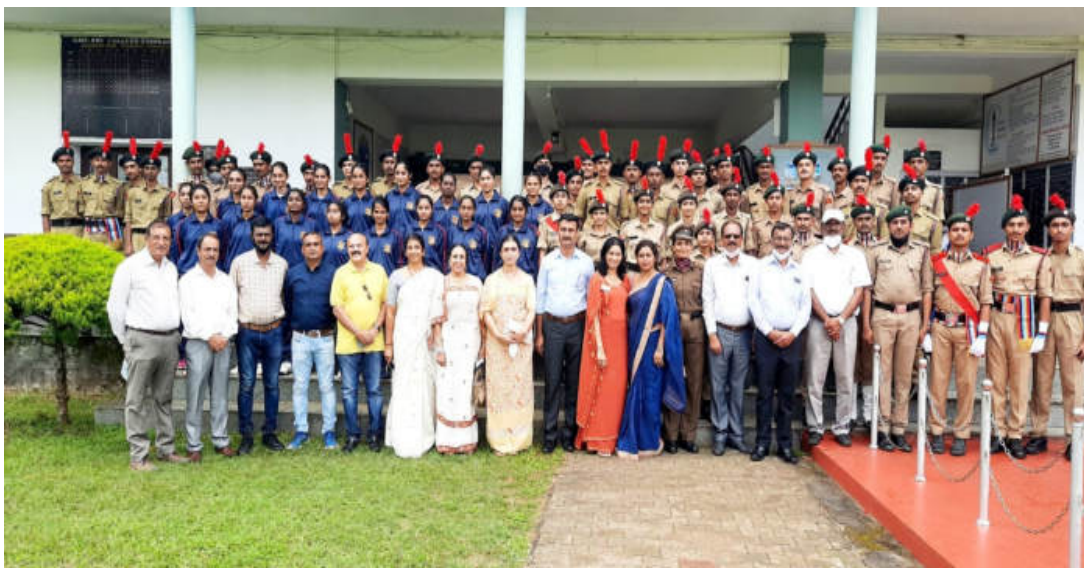
Independence Day Celebration on 15-08-2022