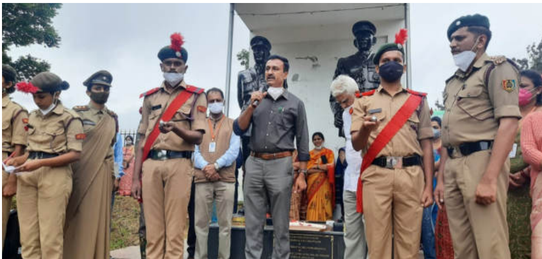
Army Day Celebration on 15-01-2021