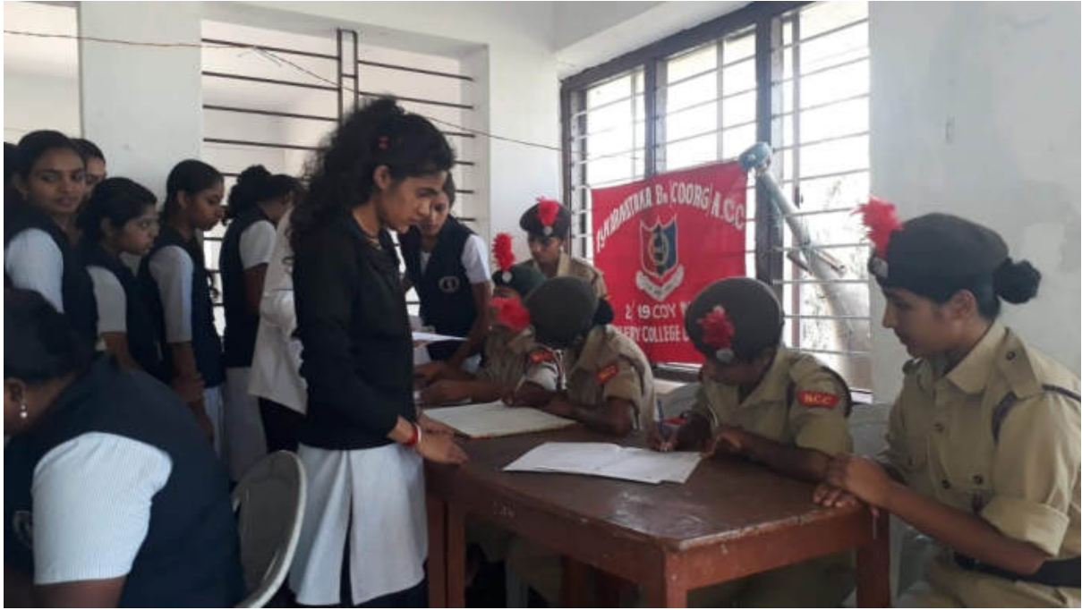
DENTAL CAMP AT CCG ON 19/2/2020