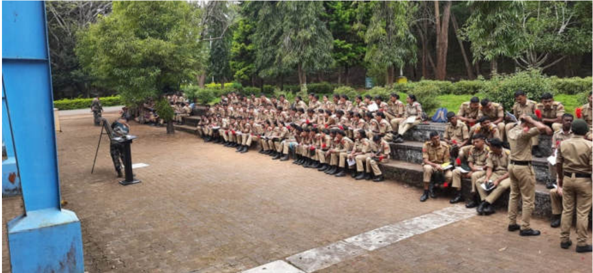
COMBINED ANNUAL CAMP AT SHIVAMOGGA DEC 2021