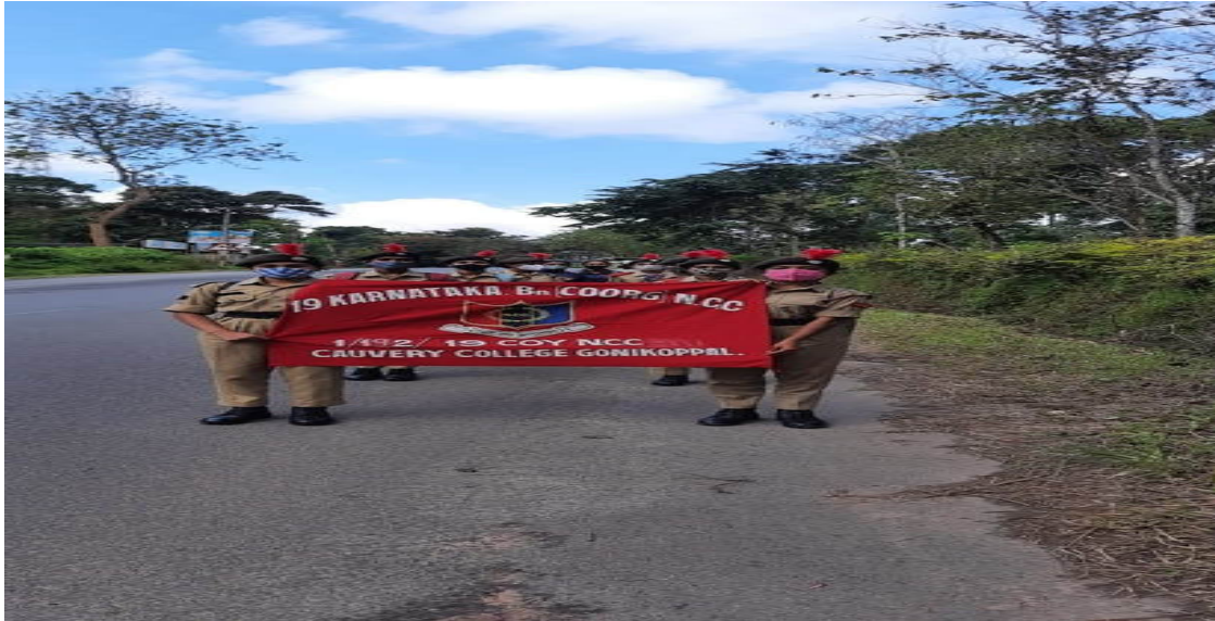
PARTICIPATED DURING GANDHI JAYANTI SWATH BHARATH RALLY BY CCG NCC SW CADETS ON 2/10/21 AT GONIKOPPAL.