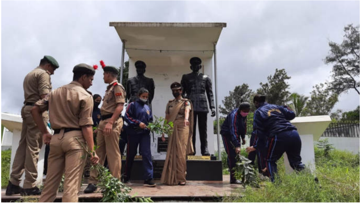
SWATCH BHARATH ABHIYAN 17/7/21 AT CCG 30 NCC CADETS WERE CLEANED NEAR CCG.