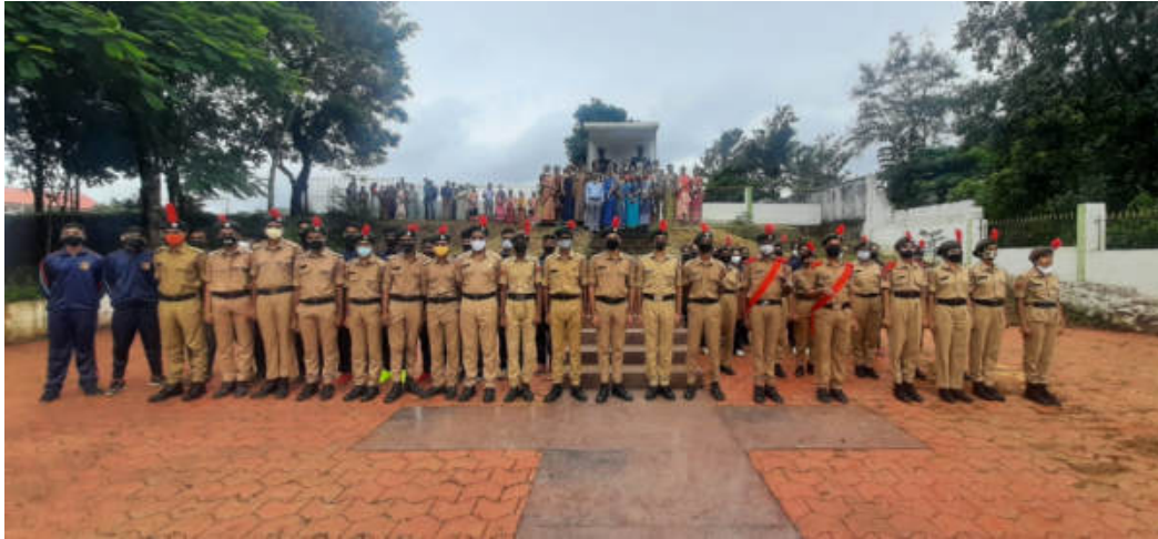
Field Marshall K M Cariappa birth anniversary celebration on 28-01-2022