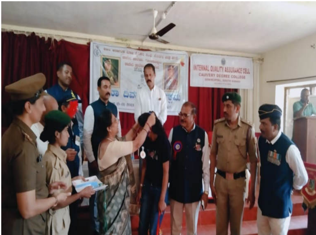
Army Day Celebration on 15-01-2023 at Cauvery college