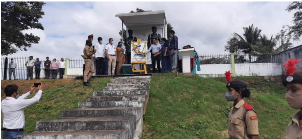
SHRUDDANJALI PUSHPA NAMANA TO CDS. GEN. BIPIN RAWAT. ST CCG ON 10/12/21. 80 NCC CADETS AND NCC OFFICERS, STAFF MEMBERS OF CCG WERE PRESENT.