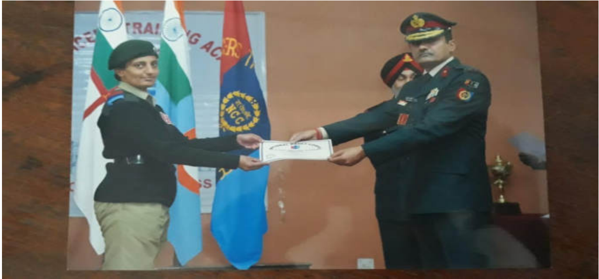
NCC OFFICER LEPAKSHI ID ATTENDED PRE COMMISSIONED COURSE AT OFFICERS' TRAINING ACADEMY GWALIOR FROM 13 SEPT 2020 TO 14 SEPT 2020 AND COMMISSIONED AS LIEUTENANT.