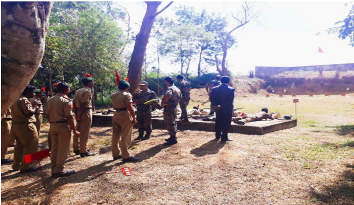
ON 3/1/2020 SHOOTING COMPETITION AT CCG (ATC CAMP) 80 CADETS AND WERE PARTICIPATED. 19 KAR BN NCC OFFICERS WERE PRESENT