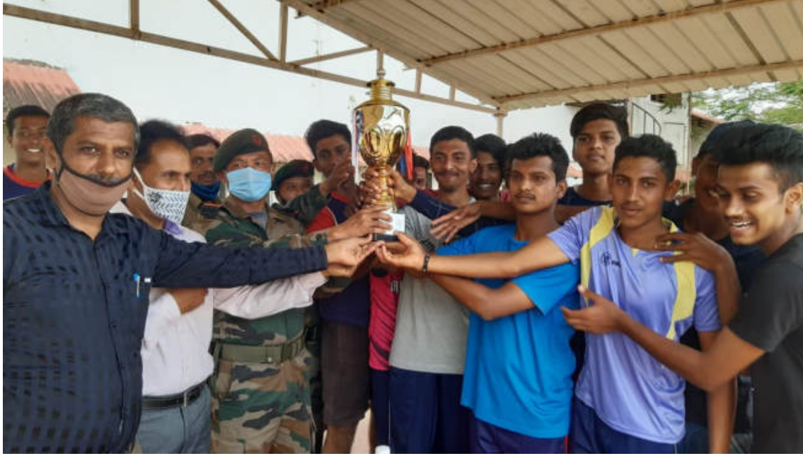
NCC day celebration on 05-09-2021