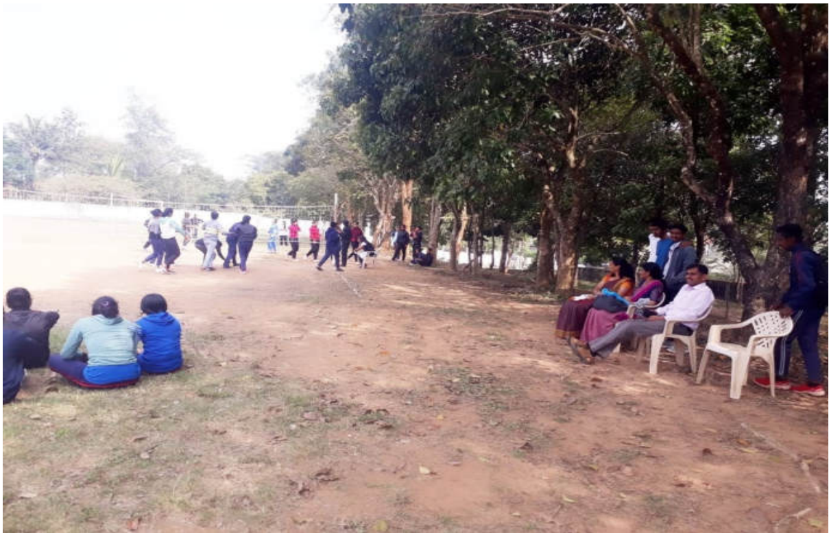
NCC ANNUAL SPORTS DAY 24/1/2020