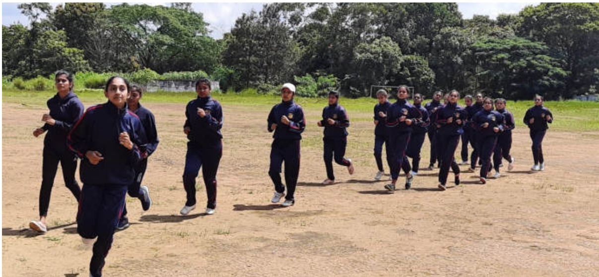
'FIT INDIA RUN' BY NCC CADETS ON 15/08/2021. 25 SW CADETS HAD PARTICIPATED PARTICIPATED DURING INDEPENDANCE DAY CELEBRATION.