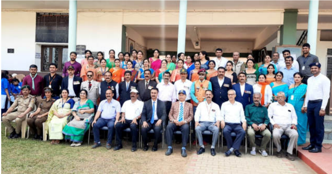
Independence Day Celebration 2021