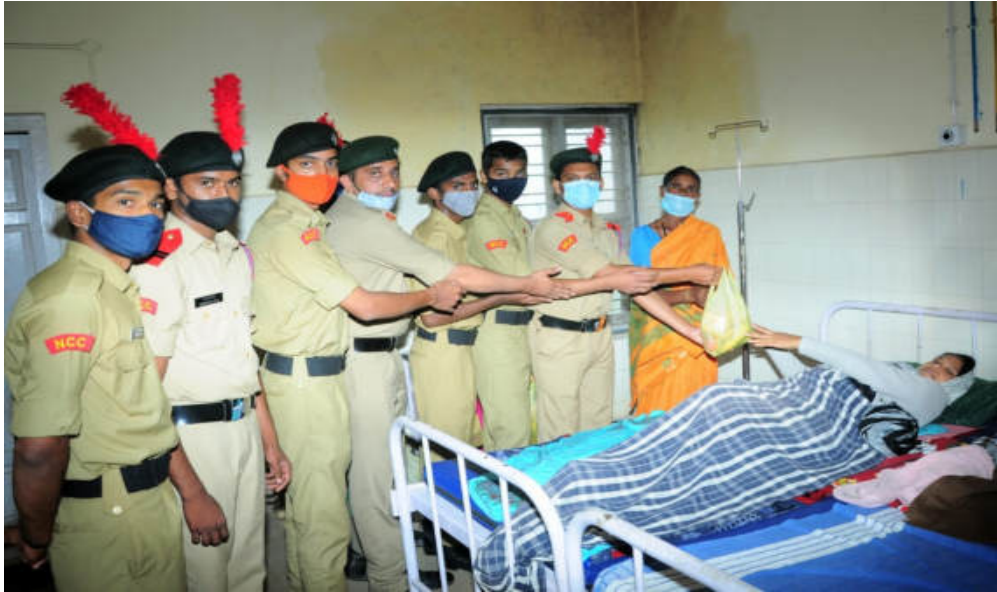
Fruits and medicine kit distributed in Government Hospital Gonikoppal, by NCC units on the eve of Gandhi Jayanthi on 02-10-2021